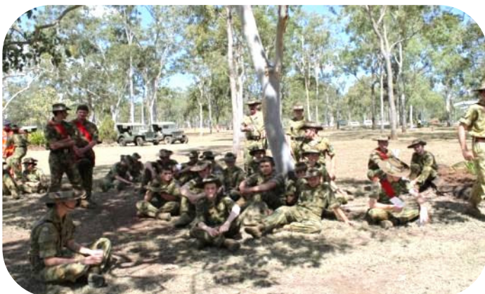
Army Cadets (Tablelands)