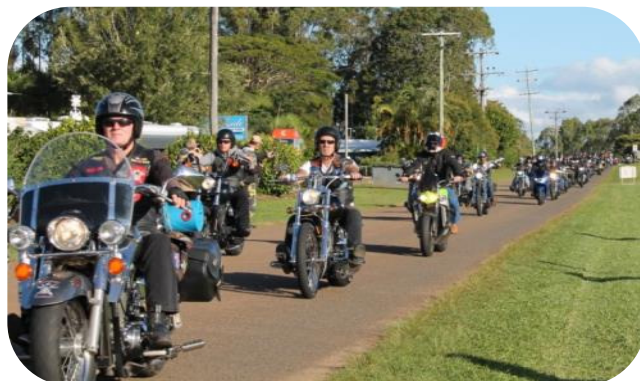
The first of the bikers arriving at the Avenue

Over 100 current and former Australian Defence Force soldiers, sailors and airmen, together with many others, participated in this event, to honour their colleagues who have been killed in Afghanistan. Together with others bikers from various other motor cycle groups, local Tablelander bikers and several members of our Association, there were more than 120 bikers who participated in the Charity Ride & Service.